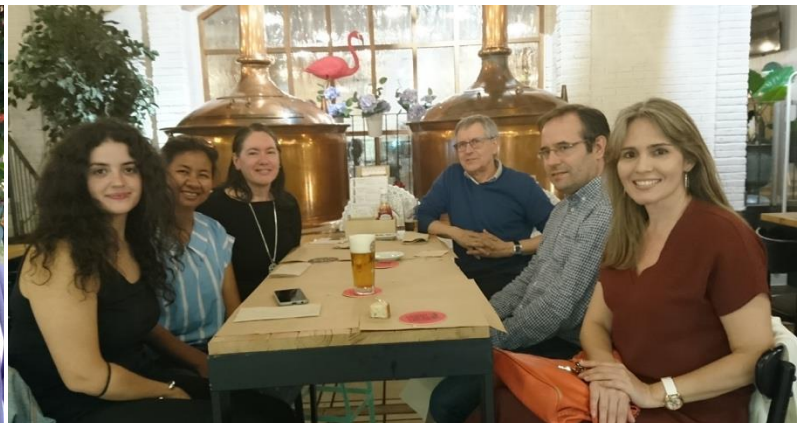
Farewell dinner in Vigo city on June 11, 2019